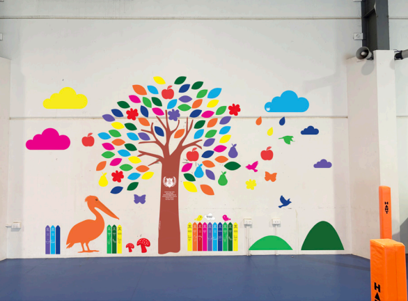
Image of proposed artwork in location